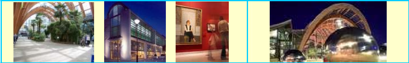
Conference Banquet Venue: Millennium Galleries in Sheffield