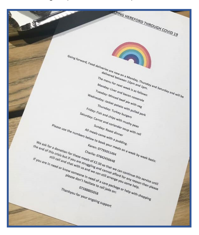
Figure 2 Meals available for delivery from the "Helping Hereford through COVID-19" Facebook group on the 9<sup>th</sup> of April 2020.

Hereford Through COVID-19". <sup>69</sup> The group promoted its help on Facebook and described itself as "a group set up to help the elderly and vulnerable and support key workers." <sup>70</sup> They provided food care packs and hot meals, with the latter prepared by chefs from local food businesses. A donation of £2.50 was asked for meals, though exceptions may have been made for people facing financial hardship. A flyer advertising what they offered the week of 9<sup>th</sup> April is pictured in Figure 2.