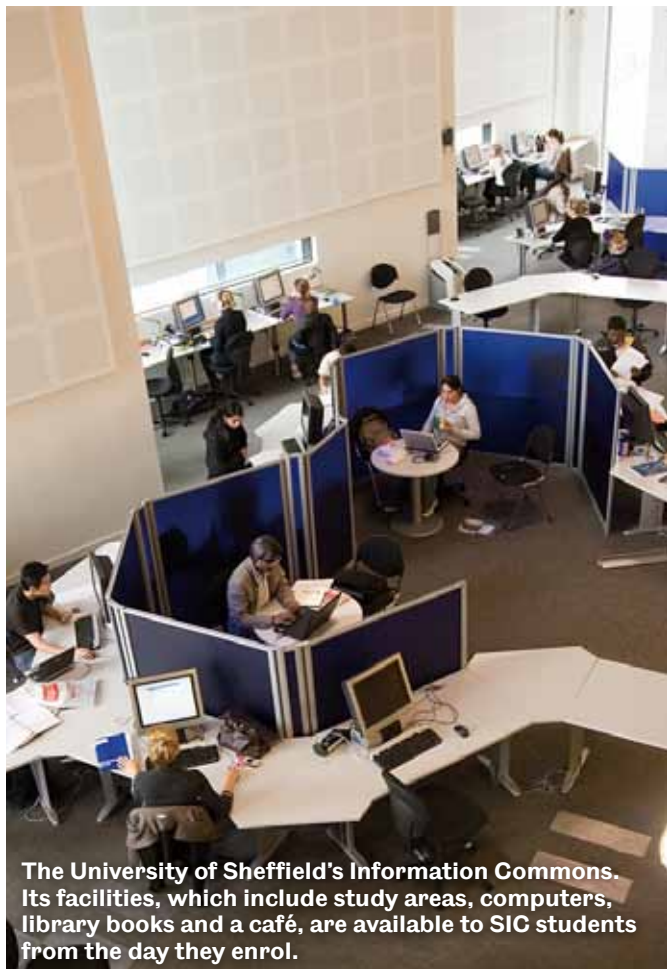
The University of Sheffield's Information Commons. Its facilities, which include study areas, computers, library books and a café, are available to SIC students from the day they enrol.

The TUoS sports facilities (Goodwins Sport Centre) are situated approximately 15 minutes walking distance to the College and this includes multiple sports courts and a gym. These are offered at a discount student rate and can be booked privately or you can join one of the many sports societies TUoS has to offer.