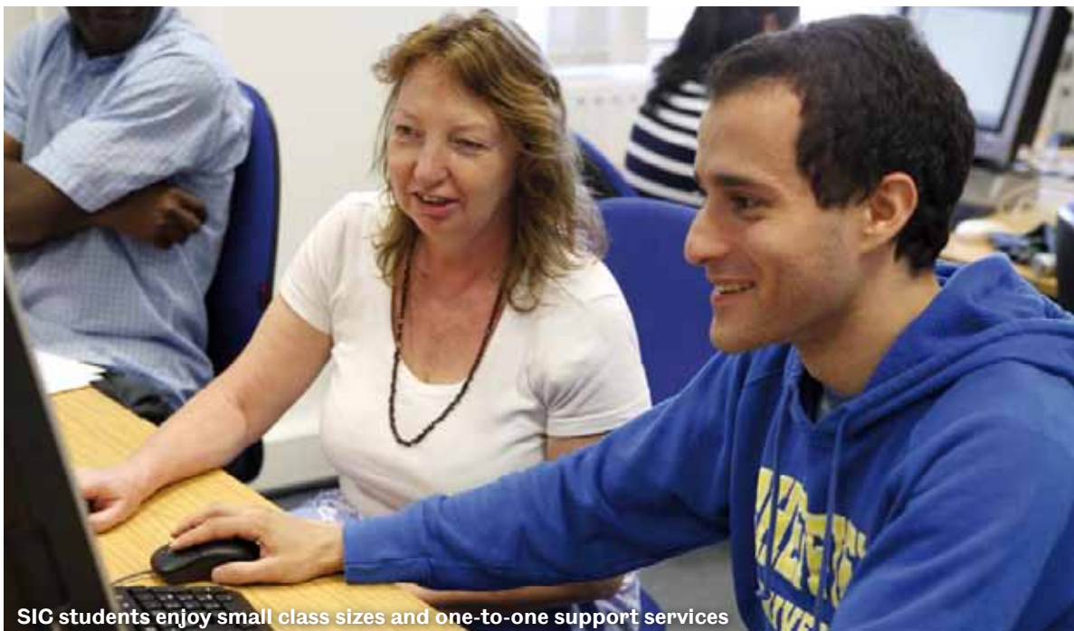
SIC students enjoy small class sizes and one-to-one support services

Standard voltage in the UK is 240 volts. To make sure that you are able to use all your electrical appliances bring an adaptor with you.