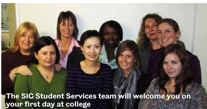
The SIC Student Services team will welcome you on your first day at college

Train: Leaves from London St. Pancras. The journey takes approximately between 2 and 3 hours and costs around £80.00. (Plan in advance: www.thetrainline.com )