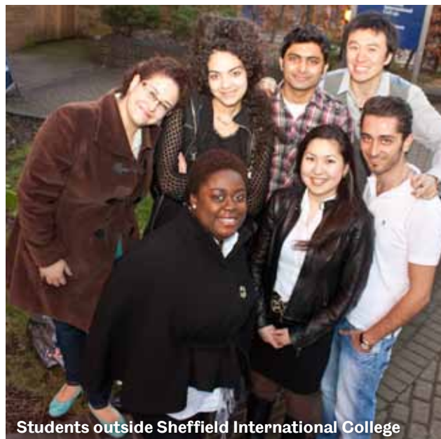
Students outside Sheffield International College