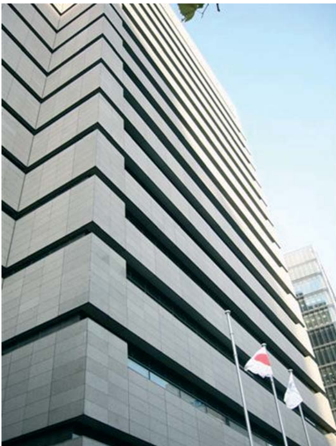
The Japan Patent Office in Tokyo (photograph courtesy of Tajima Shigeki).

If any readers are interested in pursuing a possible career in patent translation, I would recommend applying for a job as an in-house translator. You will need this to gain experience which will lead to increased accuracy and speed. To this end, put together a good CV (in Japanese and English) along with a covering letter in Japanese (ask a Japanese friend to help you with this) and send it off to translation firms. An internet search in Japanese will reveal many such firms. You can expect to have an interview entirely conducted in Japanese and possibly a test of your translation ability. And finally, best of luck!