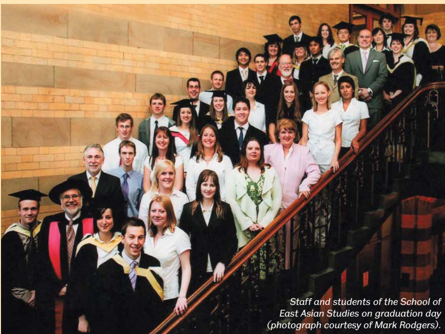
Staff and students of the School of East Asian Studies on graduation day.