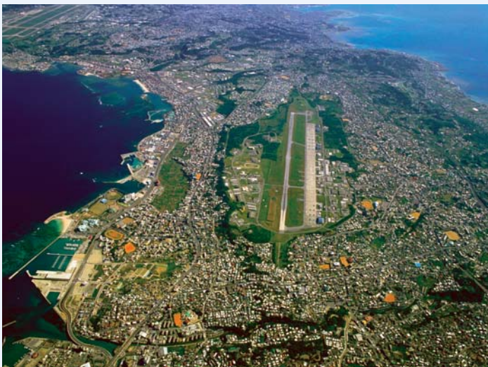
An aerial view of Futenma Air Station.

This cluster brings together a number of the School's staff specializing in politics, business and international relations. However, much of the cluster's work cuts across disciplines and is often carried out in cooperation with researchers in East Asia, as well as members of other clusters.