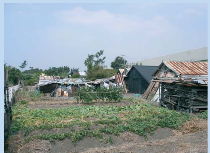
A Japanese shanty town in the shadow of a new high-speed rail link.