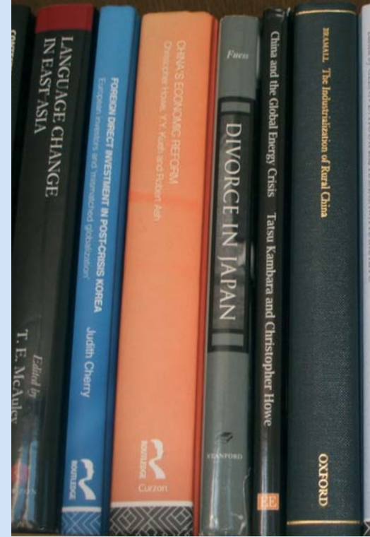
A selection of books published by SEAS staff over recent years.

“Knowledge transfer” is becoming a commonly-heard phrase these days