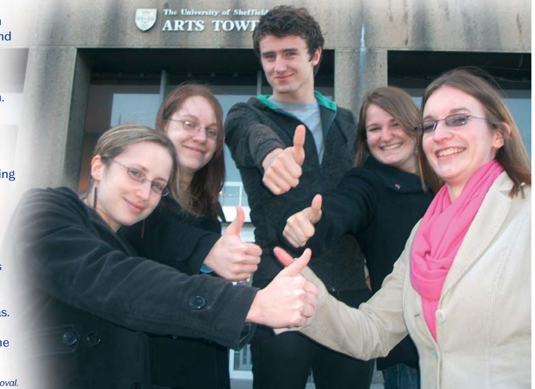
SEAS students show their approval.

More information on the National Student Survey is available at: www.unistats.com