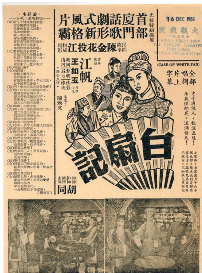
A poster for the film White Fan (reproduced with the permission of the National Archives of Singapore).

Some of my preliminary work on Amoy-dialect films was presented at the conference “Global Perspectives on Film Cultures, Film Exhibition and Cinema-going” in Belgium in December 2007, and will appear in the journal Inter-Asia Cultural Studies in March 2008. There is still a great deal more work to be done on this topic and SEAS is the perfect place to be doing it, given the School’s strong grounding in East Asian film studies.