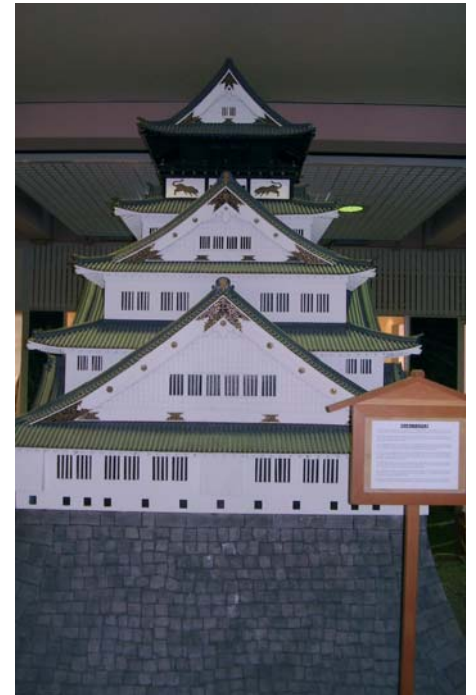
A replica of Osaka castle in San Francisco's Japantown.

I came back to Sheffield feeling inspired and was ready to embark upon my novel. It is now complete and is set in York and based on English folklore and mythology.