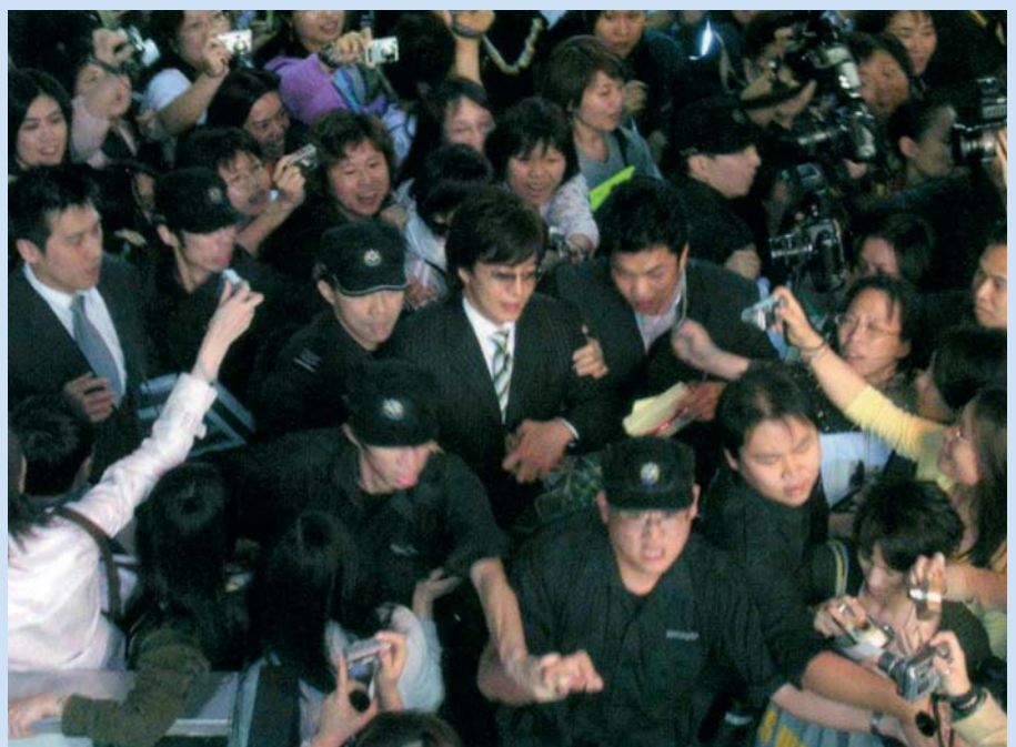
Fans welcome Yon-sama to Japan.

In short, the “Korean wave” has not only stimulated tourism but has also served to alter national identities and promote transnational cultural cooperation.