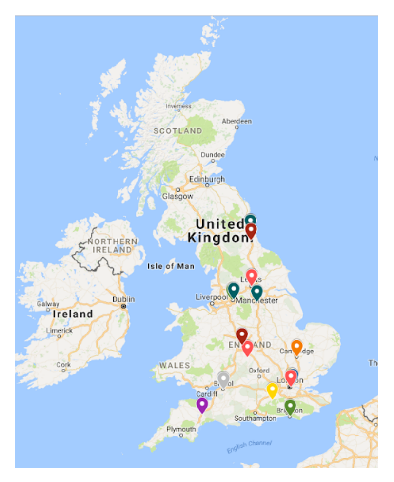
Figure 1 Map of 19 NPOs initially approached to participate

Some organisations took part in only one or two interviews and did not have the resource to facilitate further interviews or the focus groups. Another organisation was not able to participate in Phase 1 but participated in Phase 2. Other organisations found out about the work from ACE blogposts or discussions in the sector and requested involvement at a later stage.