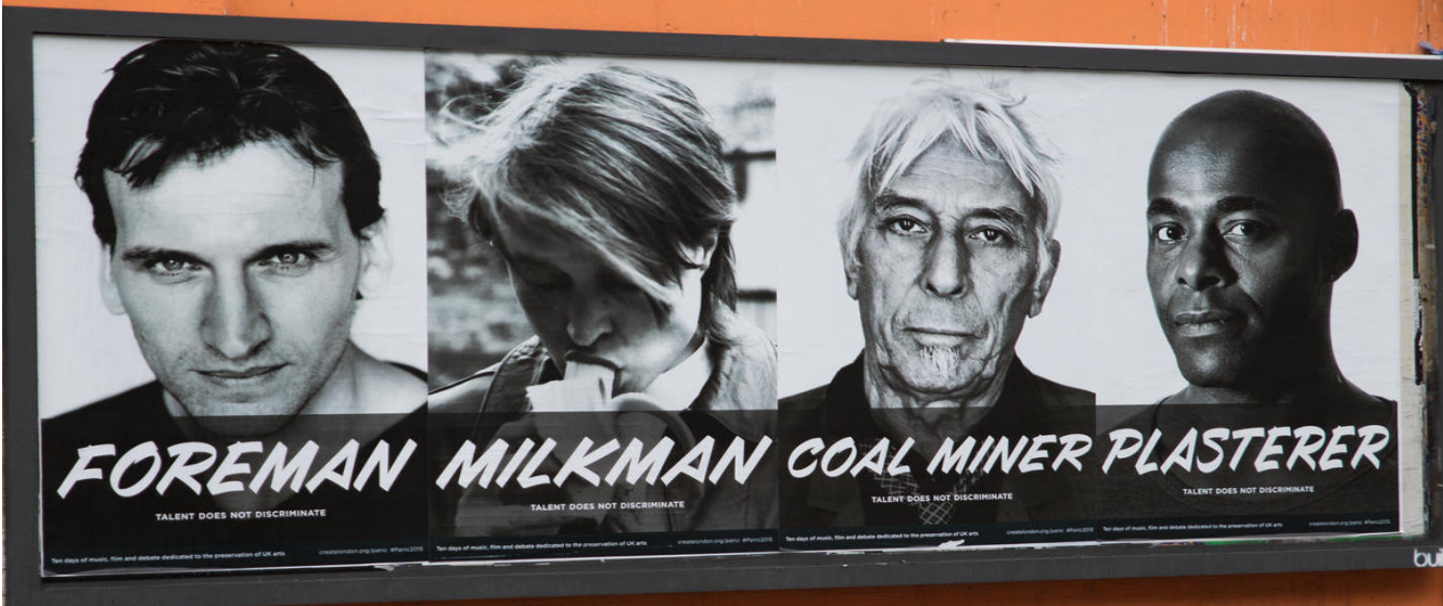
Posters of Panic! 2015 visual campaign by Peter Saville.