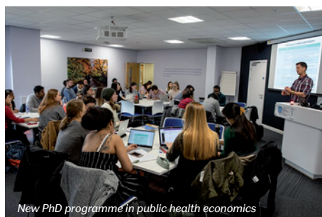
New PhD programme in public health economics

A £5.24 million investment by the Wellcome Trust will fund 35 scholars to carry out ground-breaking public health research on a new PhD programme led by SchARR.