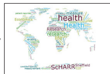
Launch of SchHARR outcomes

To find out more visit scharr-outcomes.co.uk