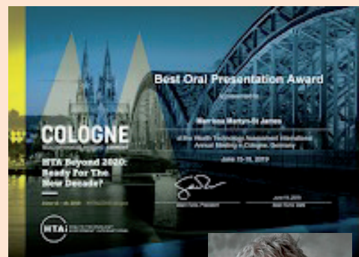
HTAi 2019 Best Oral Presentation