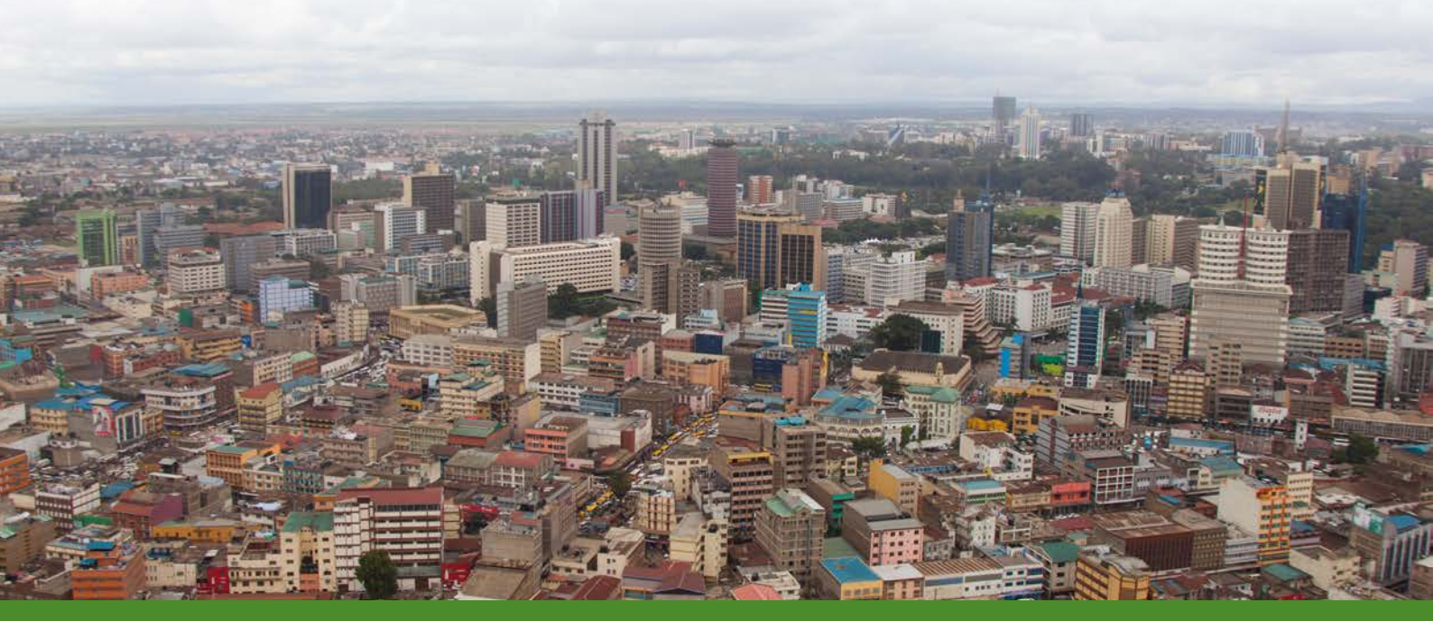
Online edition available at: www.sheffield.ac.uk/usp/research/insight

p.j.meth@sheffield.ac.uk 🖌 t.goodfellow@sheffield.ac.uk