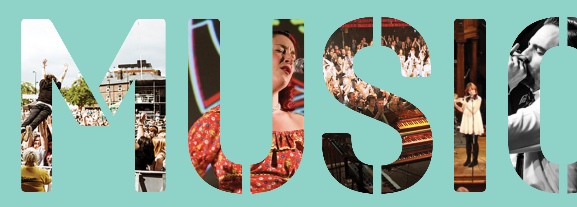
A Snapshot of Sheffield's Music Sector – Summer 2015