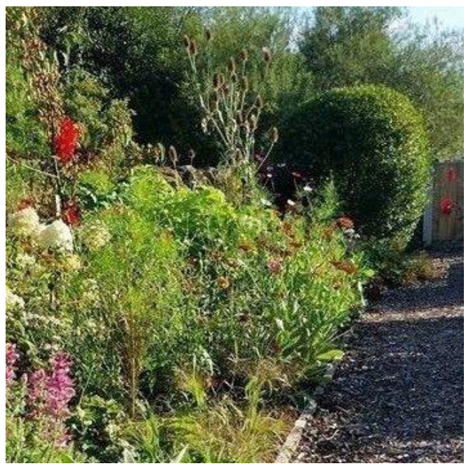
Wild in the Country Garden