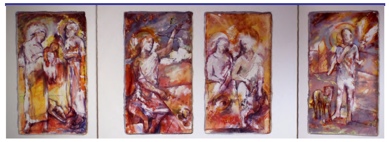
Above: Images from the Triptych commissioned by the Anglican Chaplaincy on the sibling relationship of Ishmael and Isaac.