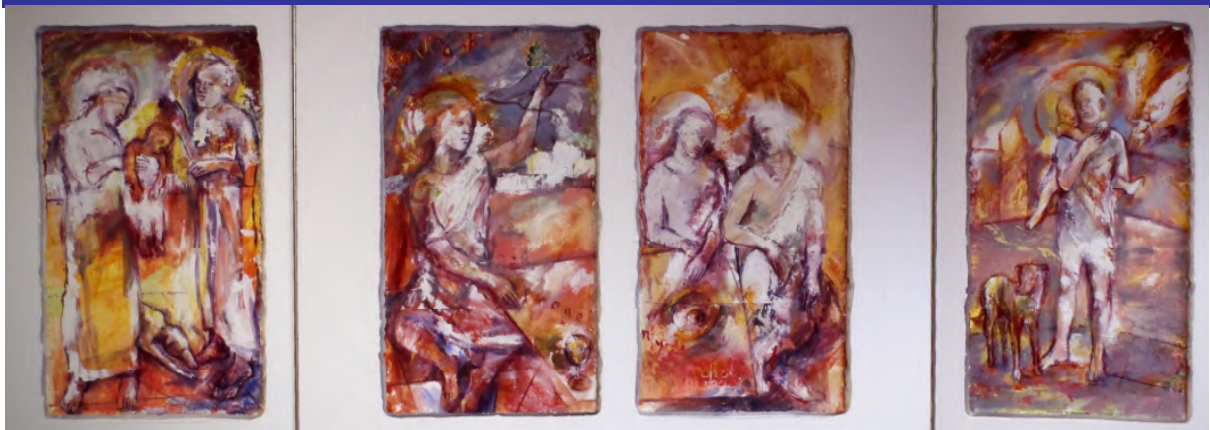
Above: Images from the Triptych commissioned by the Anglican Chaplaincy on the sibling relationship of Ishmael and Isaac.