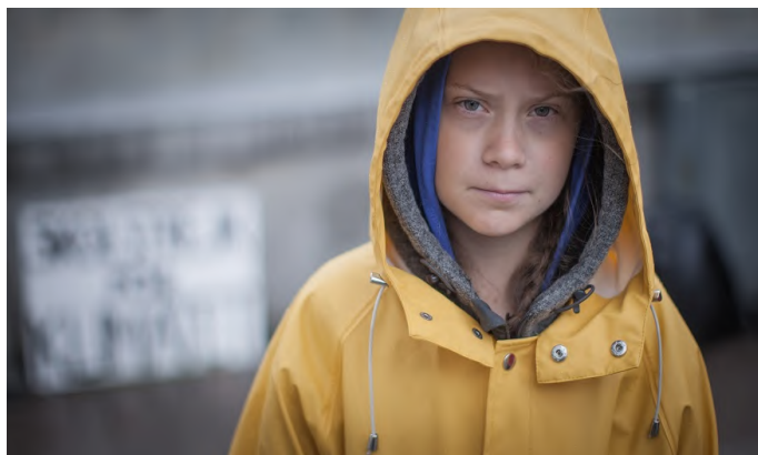
Greta Thunberg, outside the Swedish parliament.

Greta replied, 'Yeah. I know so many people who feel hopeless, and they ask me, "What should I do?" And I say: "Act. Do something." Because that is the best medicine against sadness and depression. I remember the first day I was school-striking outside the Swedish parliament, I felt so alone, because everyone went straight past, no one even looked at me. But at the same time I was hopeful.'