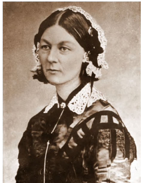
Florence Nightingale circa 1850s

Hope and dissatisfaction are matters that a founding force of modern health-care understood especially well: Florence Nightingale explains: 'Were there none who were discontented with what they have, the world would never reach anything better.' Her determination came out of a self-awareness that's feminist and frank: she said: 'I do see the difference now between me and other men. When a disaster happens, I act and they make excuses.'