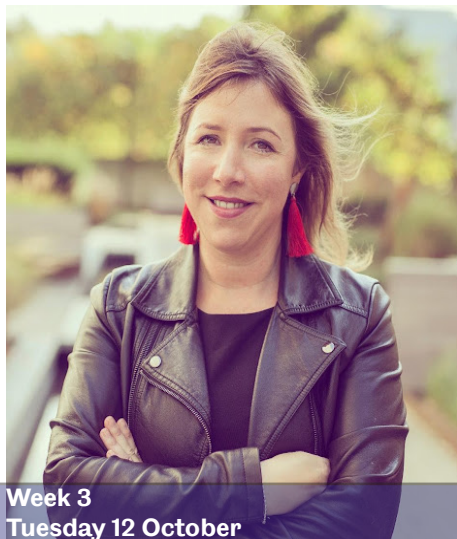
Week 3 Tuesday 12 October