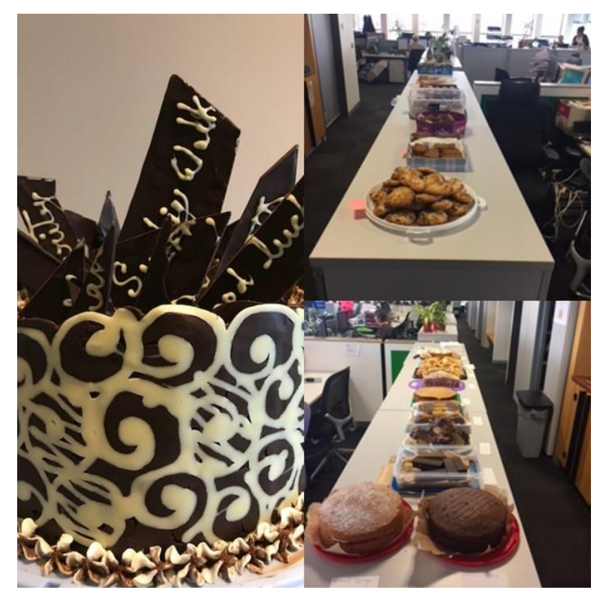
Amazing bake sale line-up run by "Fitbits and Fatbots" Finance team for the Big Walk 2018