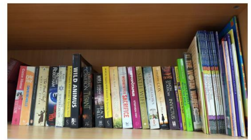
A selection of books from team #Researchwell's sale