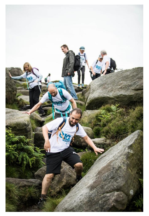
Can't avoid hills! Our walkers carefully navigating Froggatt on the Big Walk 2017