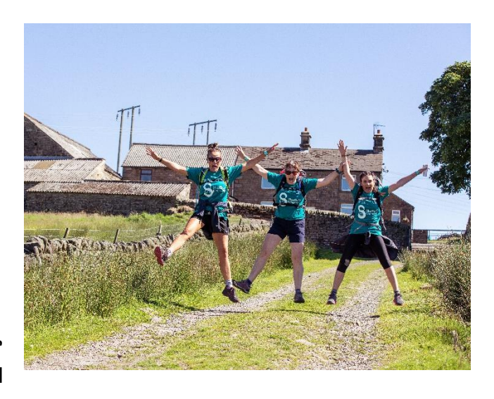
The Big Walk 2018

You will be asked to sign for the buckets, agree to adhere to some common-sense rules over their use and take responsibility for their return to us at the CAR office at 40 Victoria Street.