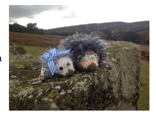
A couple of Hetties out in the Peak District