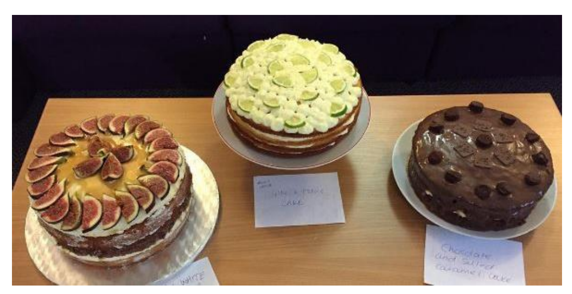
The final entries for the Alumni Office Bake-Off competition fundraising for the Big Walk 2016