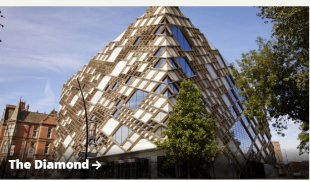
Image from The University of Sheffield Library web page <a href="https://www.sheffield.ac.uk/library/library-sites">https://www.sheffield.ac.uk/library/library-sites</a>