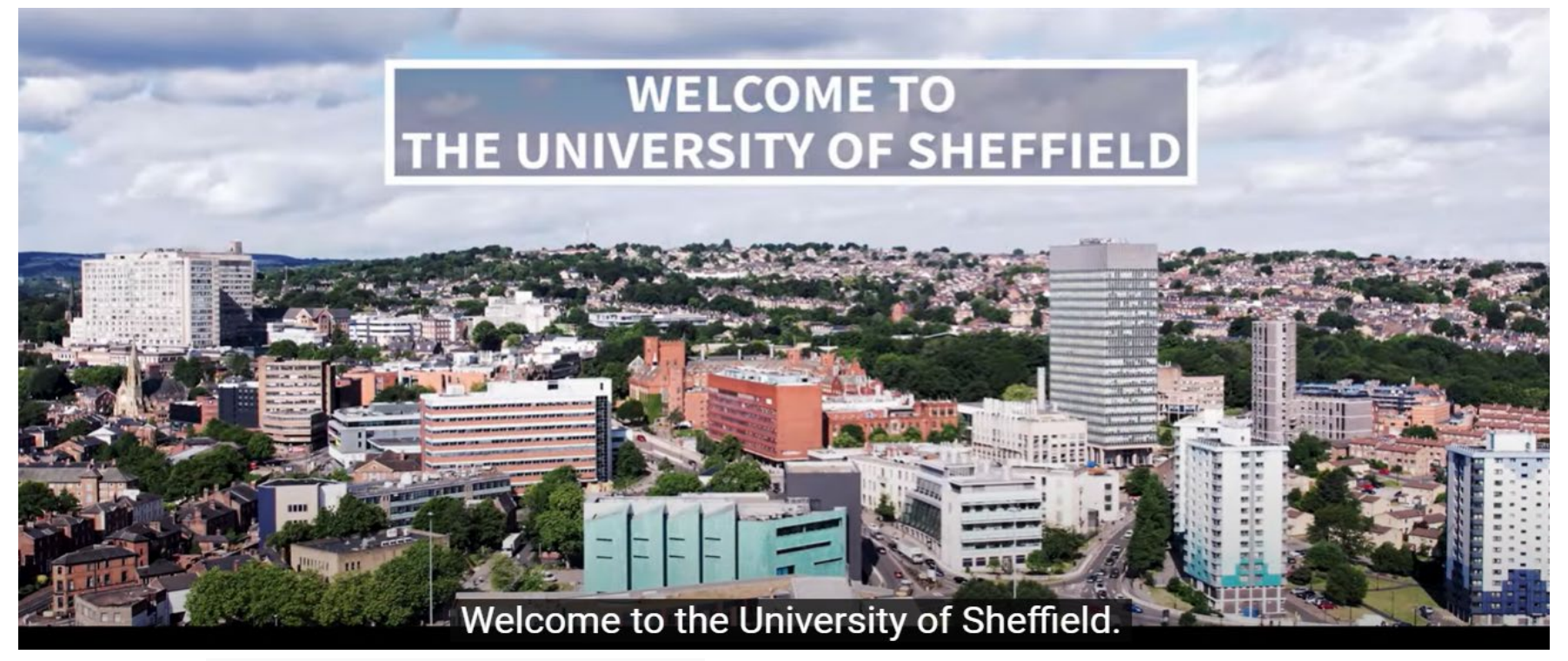
Image from "University of Sheffield Aerial Tour 2022" YouTube video <a href="https://www.youtube.com/watch?v=Vu8znokD1d4">https://www.youtube.com/watch?v=Vu8znokD1d4</a>