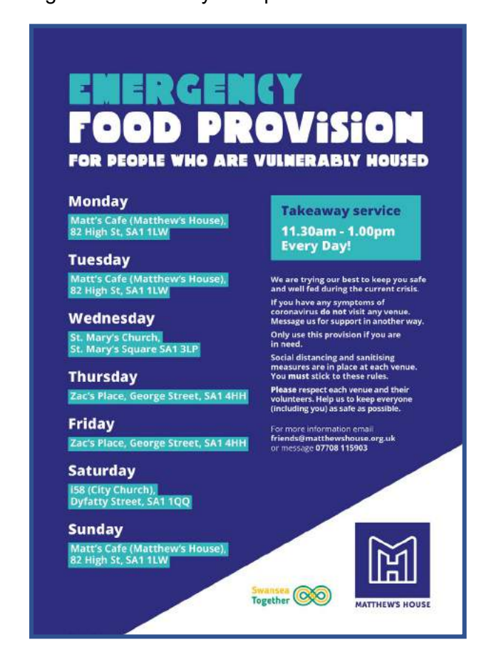
Figure 2: Takeaway food provision locations across Swansea over autumn 2020.

Over 12 April 2020 to the end of August, the Swansea Together campaign supplied a total of 23,185 meals. The delivery of meals was slowly phased out over the last month, replaced by takeaway pick-up instead. In part, this was because groups that had been a part of the project delivery, such as the Swansea City Football Club and council staff, were returning to their usual roles. Similarly, the bingo hall that had been used as a site for food preparation was re-opening. Takeaway also became possible because many of the sites that had been shut were re-opening. At the time of our interview (November 2020), the Swansea Together project was operating a seven-day-a-week takeaway service from 11.30-1pm in four locations across the city (Matthew's House, St. Mary's Church, Zac's Place, and i58 (City Church), serving about 80-100 people a day. As shown in Figure 2, this provision was targeted towards people who are vulnerably housed and in need of food.