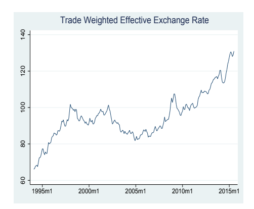
Figure 1: Exchange Rate Series