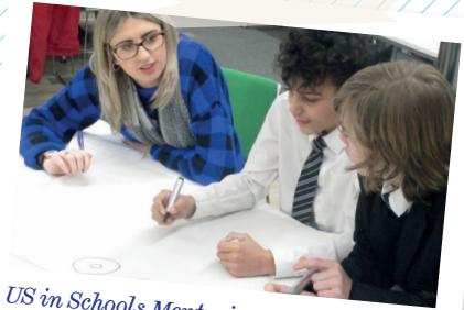
US in Schools Mentoring Session

Our mentors are encouraged to focus on helping to build their mentees confidence, resilience, and love of learning. They hope to improve their attainment and raise their aspirations, directing them to sources of information to help them become independent learners, and make informed decisions about their future education and career choices.