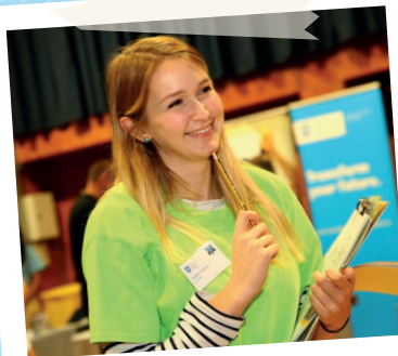
US in Schools Mentor

My team had really uplifting people and we would share ideas in the taxi journeys as well as just encouraging each other. Also it was great to see mentees developing and achieving their SMART targets.