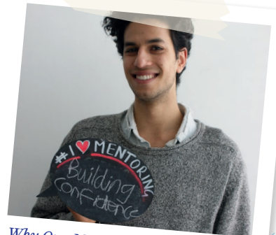
Why Our Mentors Love Mentoring

Mentees will also have the opportunity to work together in a group session during the programme, which will include a mentor-led session introducing mentees to university life and help develop team working skills.