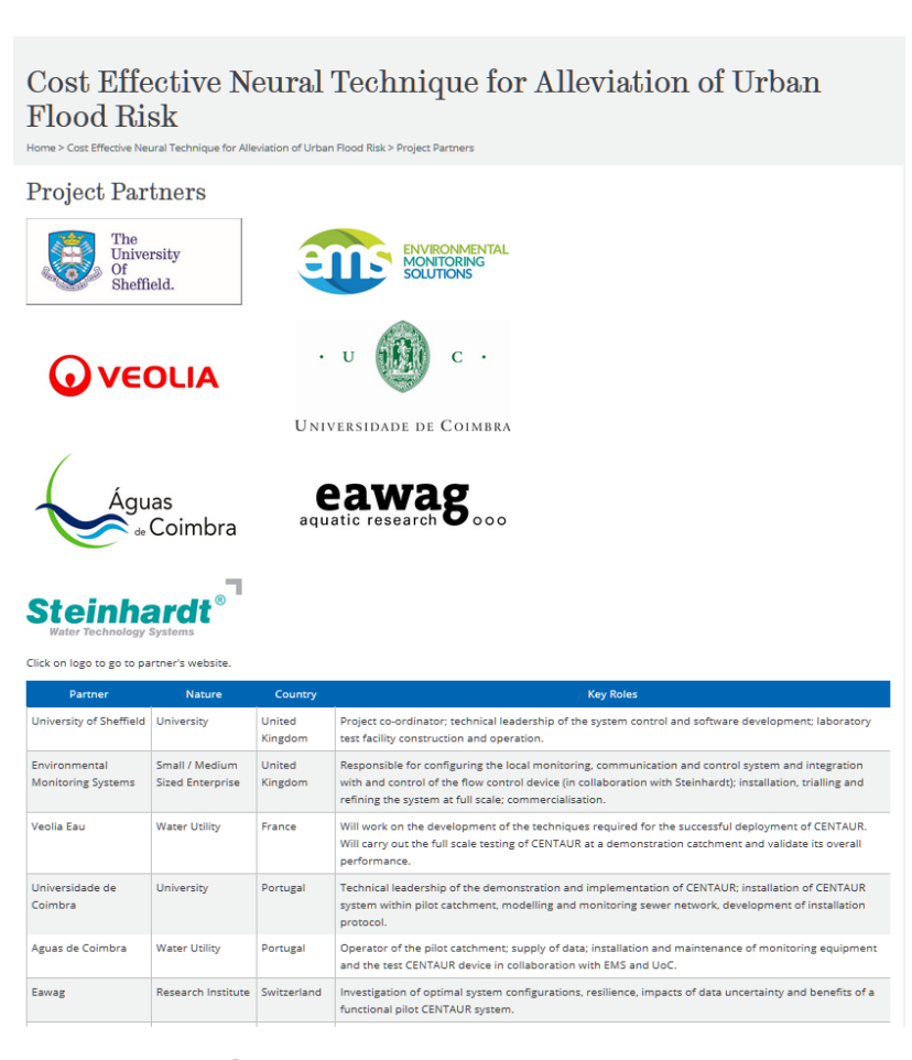
Figure 4: Project Partners page