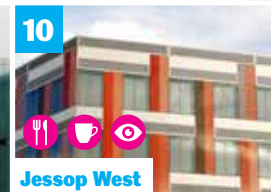
10 Jessop West