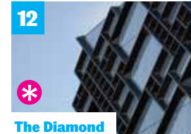
12 The Diamond