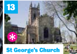
13 St George's Church