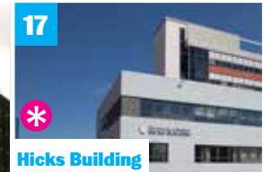
17 Hicks Building