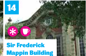
14 Sir Frederick Mappin Building