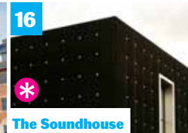
16 The Soundhouse