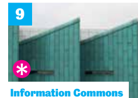
9 Information Commons