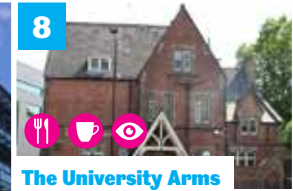
8 The University Arms