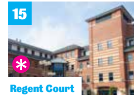
15 Regent Court