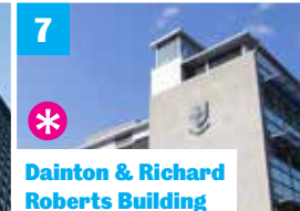
7 Dainton & Richard Roberts Building