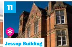
11 Jessop Building