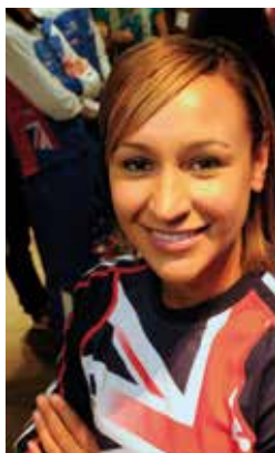
Dame Jessica Ennis-Hill