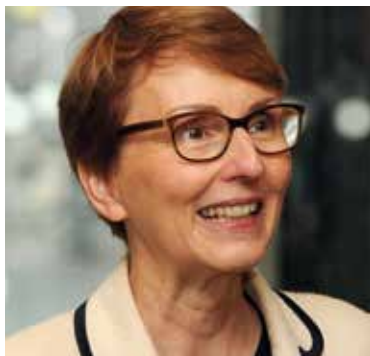
Dr Helen Sharman, CMG, OBE