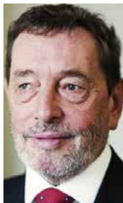
Lord David Blunkett