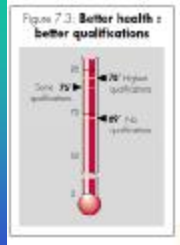
Labour Force Survey x EQ-5D thermometer